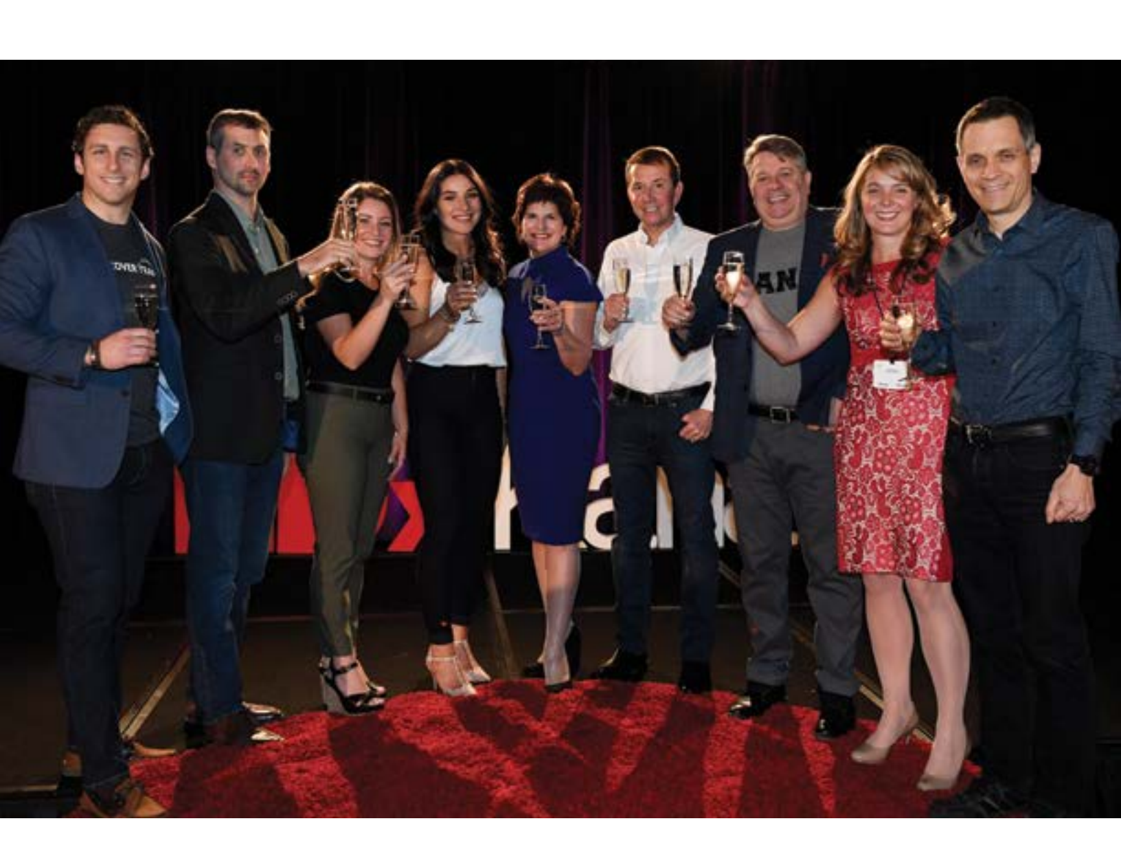
IDEAS WORTH SPREADING.